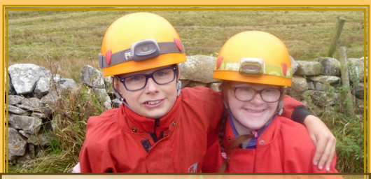
This is going to be exciting.