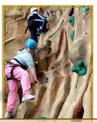
I'm going to get to the top.