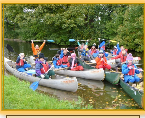
We are the Champions.